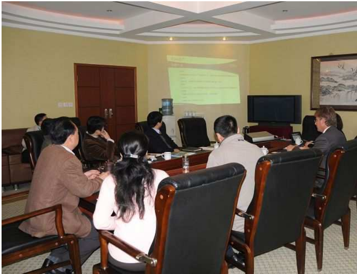
Situation introduction by two parties