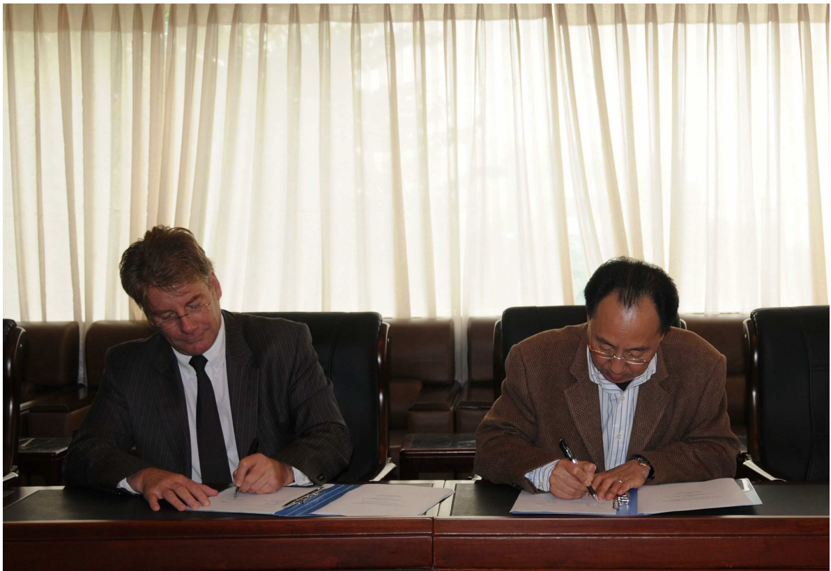
Cooperation MOU signature by two parties